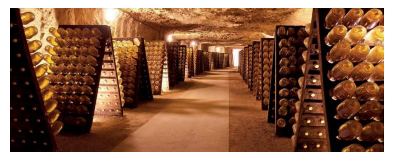
Visit 3 - Dive into Chenin Blanc through the sparkling wines of Saumur

A sensory and historical journey not to be missed for all Chenin Blanc and terroir enthusiasts.